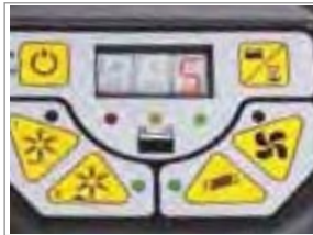
INTUITIVE CONTROL PANEL